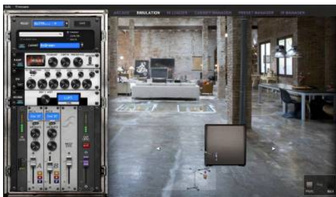
The Simulation mode gives you access to all parameters and the two microphones, which can be placed at the front or the back of the cabinet.