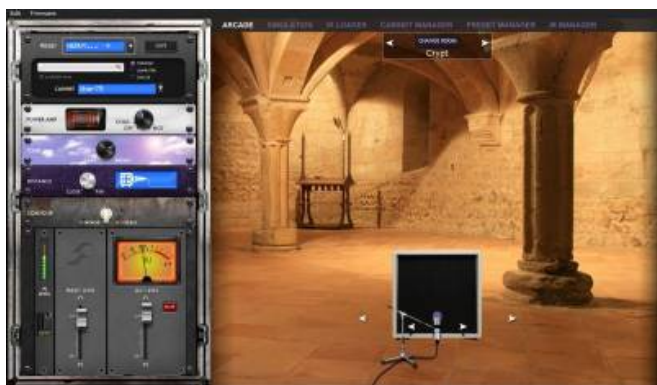
Arcade mode with the simplified rack and one microphone to move around the cabinet.

Like the hardware rack, the Remote is arranged around the 3 modes : Arcade, Simulation and IR Loader. Here are the different layouts.