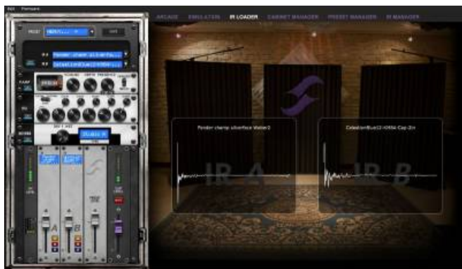
The IR Loader mode gives you quick access to the 2 IRs you can use simultaneously, with a bigger display to visualize the complete name of the files.

The Remote allows you to easily organize your Two notes virtual cabinets, your presets and your third party IRs.