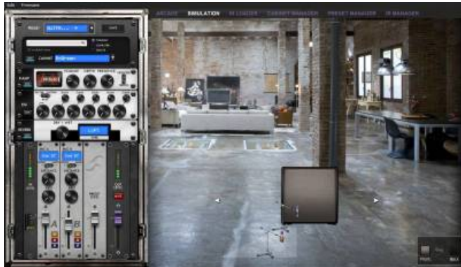
The Simulation mode gives you access to all parameters and the two microphones, which can be placed at the front or the back of the cabinet.