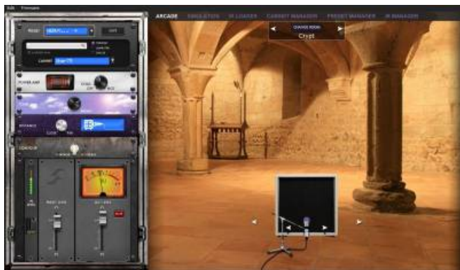
Arcade mode with the simplified rack and one microphone to move around the cabinet.

Like the hardware rack, the Remote is arranged around the 3 modes : Arcade, Simulation and IR Loader. Here are the different layouts.